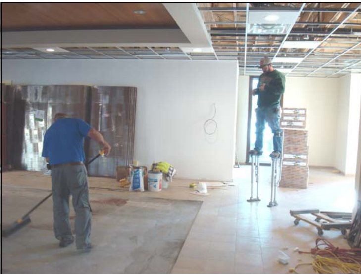
Getting the gathering area ready

We are almost there! At least with phase one (the new addition and remodel of the old CE wing). Right now we are looking at a completion date of Friday, October 28 for phase one. Then we will have one week to move everything downstairs into our new space. Work will begin on Phase 2 (underneath the sanctuary) through November and into early December. The Thanksgiving Meal on Sunday, November 13 is looking like our first big meal in the new space. We have much to be thankful for!