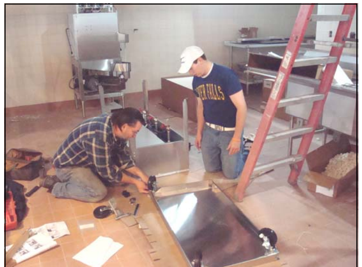
Working on the new kitchen