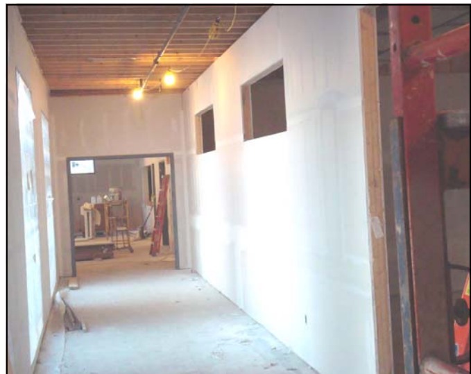
Hallway to the new Fellowship Hall