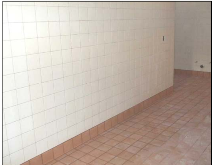
Tile in the new kitchen

If you haven't checked out the new offices or progress on the building site, do so soon!