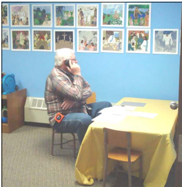
We are Gulliver living in a Lilliputian world.