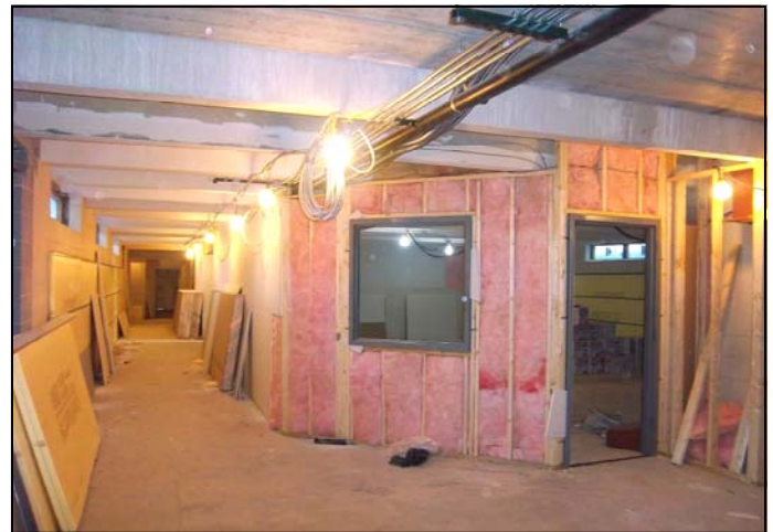
This is where the Fellowship Hall used to be.